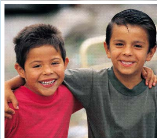
Our community-based programs help Atlantic County residents of all ages enjoy healthier lives.