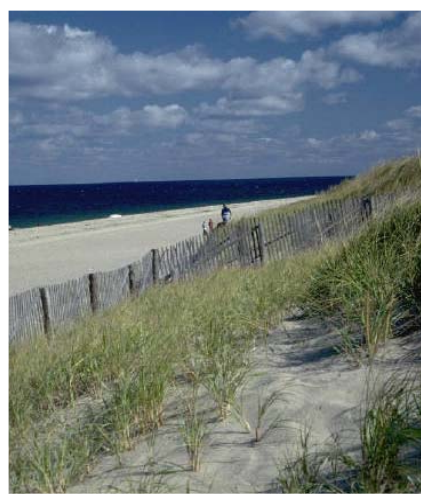
Wherever you go in Atlantic County, we can help you enjoy healthy living in a healthy community.