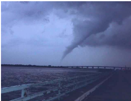
Tornado, Somers Point, July, 2001