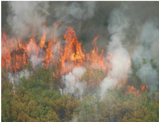
Atsion Fire, Hammonton, August 2007