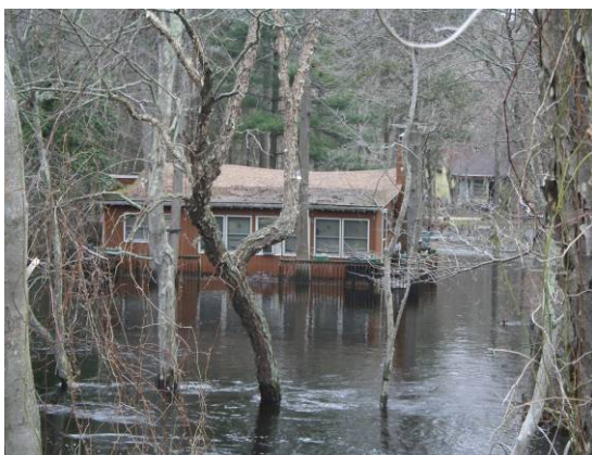
Northeast Storm, Hamilton Township, April 2007