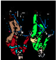
Borrow Bikes and Sports Equipment Free

Visitors to the Estell Manor Park may borrow bikes and helmets, volleyballs, softball equipment, soccer balls, horse-shoes, jump ropes, frisbees and tetherballs at the W.E. Fox Nature Center. An adult must be with any child borrowing equipment and must present a valid driver's license. Children under 14 must wear helmets while riding bicycles as per New Jersey State Law. Note: Individuals with special needs may request the use of a three wheeled bike. We reserve the right to keep this bicycle available for special accommodations only.