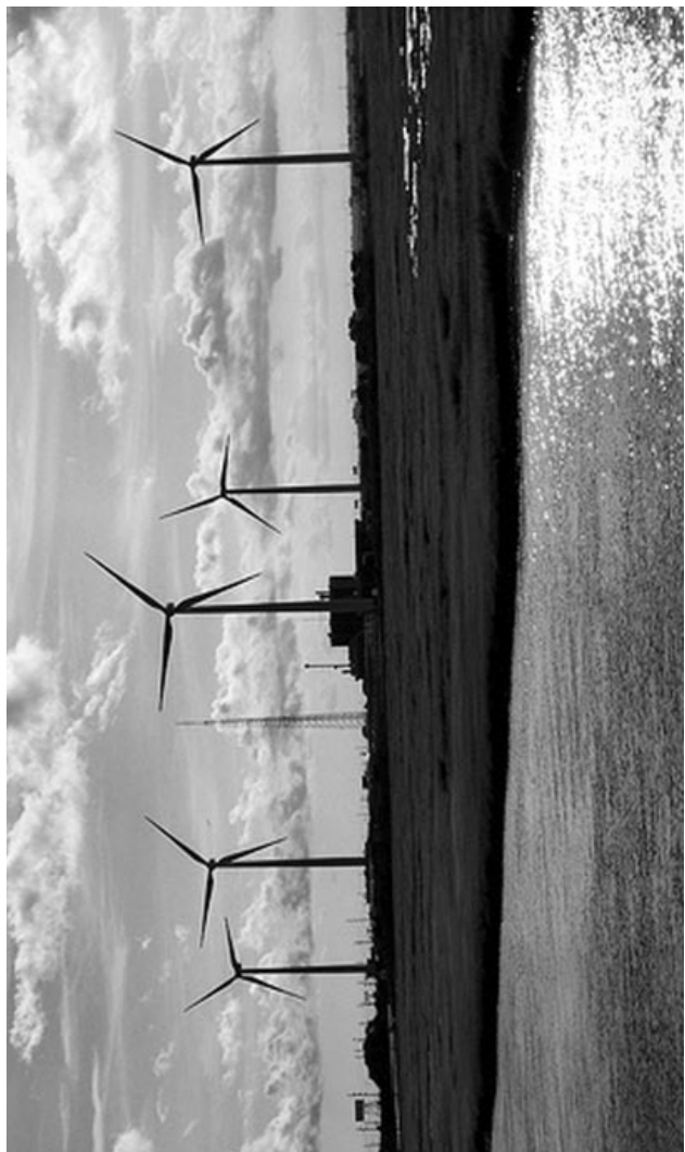
ATLANTIC COUNTY WIND FARM